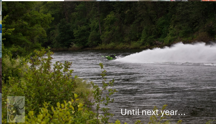
Until next year...