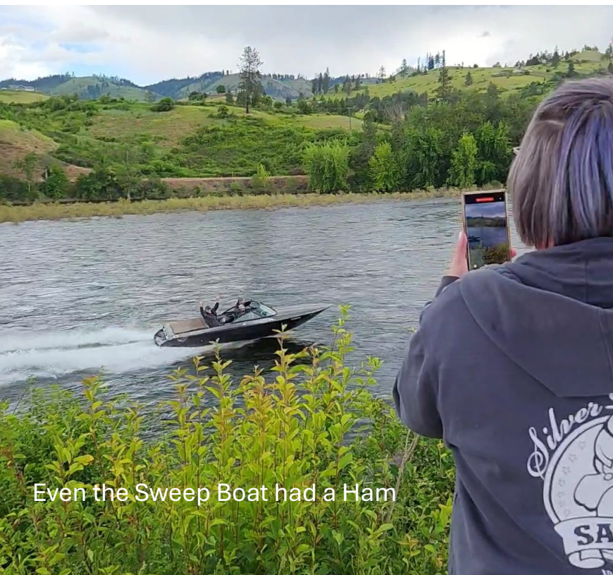
Even the Sweep Boat had a Ham

The Sweep Boat is the last to cross the finish line at either end of the course.