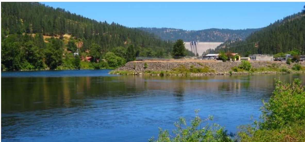
Clearwater River at Orofino—Dworshak Dam